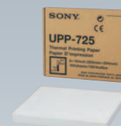
UPP-725 Media Thermal Paper Printing Pack Contents: 100 sheets of print paper