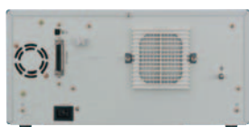
UP-D72XR Back Panel