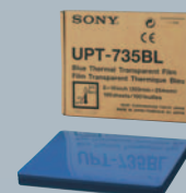
UPT-735BL Media Blue Thermal Film Printing Pack Contents: 100 sheets of print film